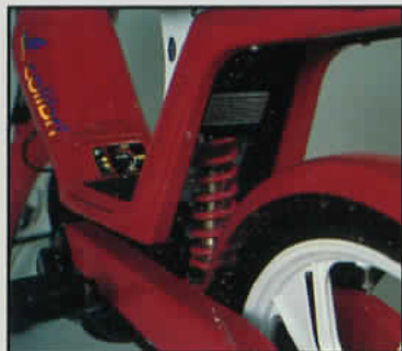
Mono Shock Suspension System