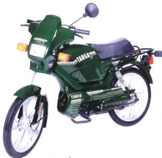
Targa LX Forest Green