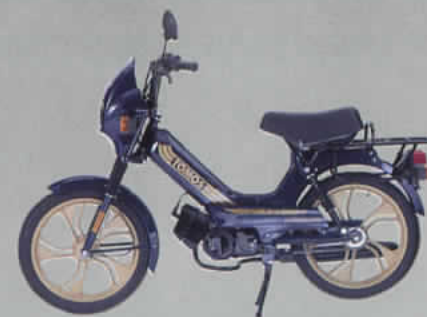
A35 GOLDEN BULLET