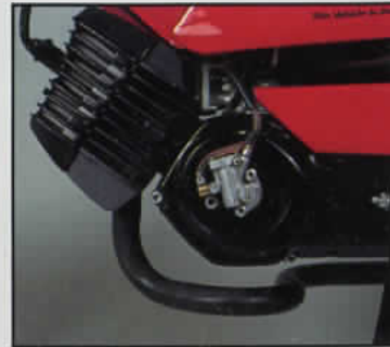
Oil Injection System