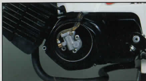
Oil Injection System