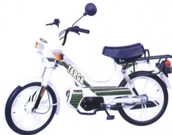
Targa Emerald Green