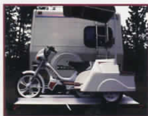
RV Moped Carrier for motorhomes and 5th wheelers