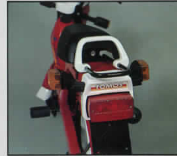
Fold-in Direction Indicators