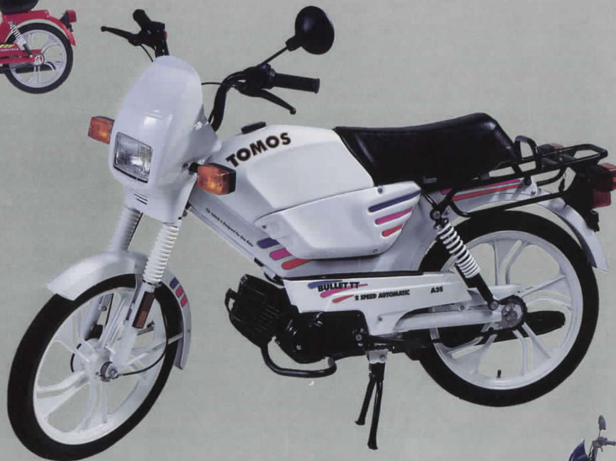
A35 BULLET TT