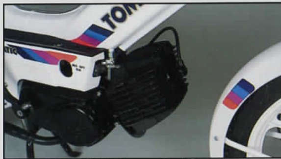
High Torque Engine