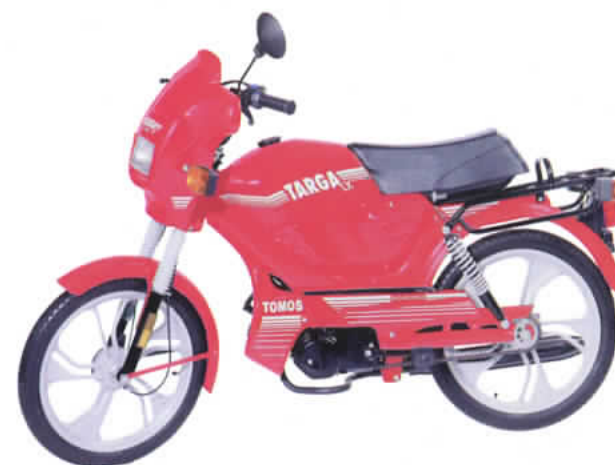
Targa LX Dynamic Red