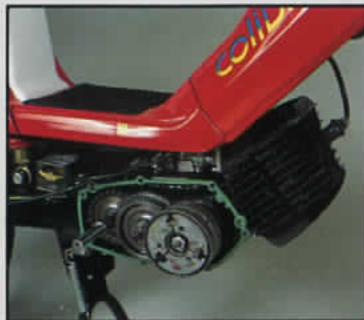
High Performance Engine