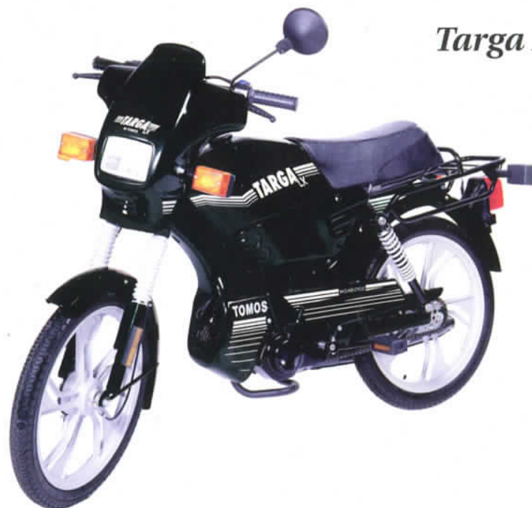
Targa LX Jet Black

Luggage Rack Locking Gas Cap Viper Tread Tires Ram Air Induction Cooling System Whisper-Smooth Throttle System CDI Electronic Ignition Auto Mix Oil Injection Deluxe Styling Turn Signals Turbo Loc 2-Speed Transmission Sport Fairing Mag Wheels Tomos Posi-Start Reed Valve 100 + Miles Per Gallon 1 Gallon Gas Tank with 1 pint reserve Left-Hand Mirror Coil Spring Shocks 6-month, 4,000-mile Warranty Tomos Exclusive: Quality Assured Program